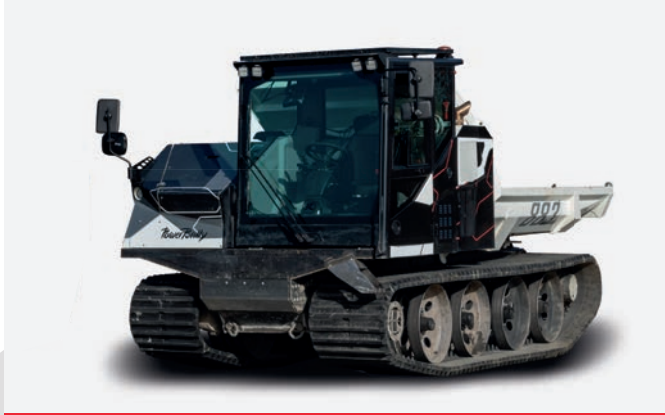
PowerBully 9D - Payload of 7.5 metric tons