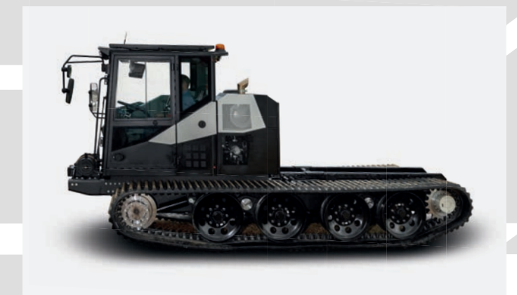
PowerBully 9C - Payload of 9.0 metric tons